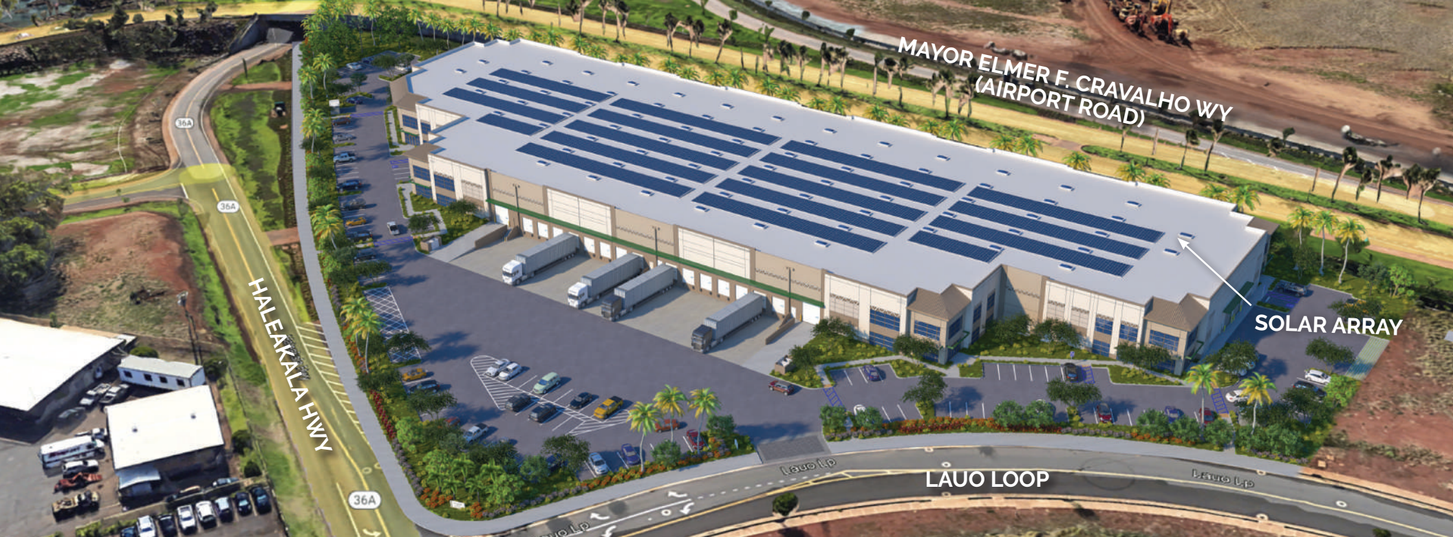
Bird's-eye-view rendering of property, see site plan for layout